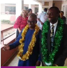
During the commissioning of APHPN Anambra State secretariat at Neni