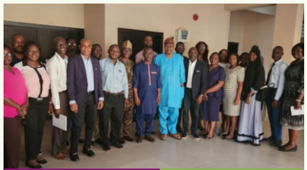
Official visit to APHPN Ogun State Branch