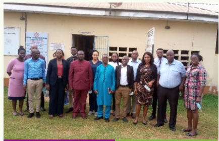
Official visit to APHPN Delta State Branch