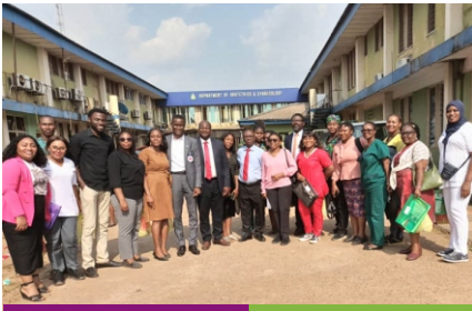
HCiD Training in UBTH, Benin City