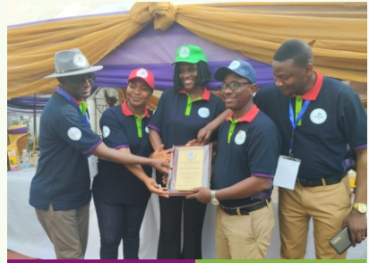
Presentation of award to the APHPN Plateau State Branch during the Golden Jubilee celebration