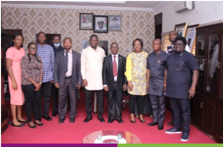
Official visit to APHPN Bayelsa State Branch