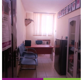
APHPN Liaison Office in Abuja