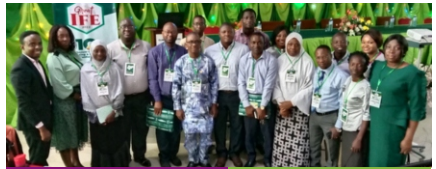
Official visit to APHPN Osun State Branch