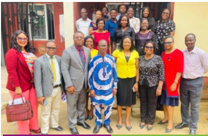
Official visit to APHPN Akwa Ibom State Branch