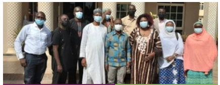
Official visit to APHPN Kaduna State Branch