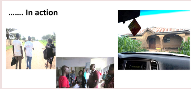
Figure 2. Ethnography in action

3. Grounded theory was developed by two sociologists, Glaser and Strauss in 1967. Data are collected and analyzed and then a theory is developed that is grounded in the data 20 . The grounded theory method uses both an inductive and a deductive approach to theory development 21 . The inductive approach starts with a question (classical grounded theory can even begin simply with data collection) 22 . Concepts and theory then ‘emerge’ from the data and the theory is ‘grounded’ in empirical enquiry 23 . This is different from the traditional deductive approach to social theory 24 .