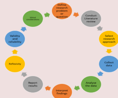
Figure 4. Steps in conducting qualitative research (Created by author)

Data collection techniques include systematic information gathering, which mitigates haphazard data collection. The diagram below summarises the key components involved in conducting qualitative research. However, this process is iterative.