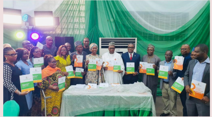
Official launching of the National Mental Health Policy and National Suicide Prevention Strategic Framework by the Coordinating Minister of Health Dr. Muhammed Ali Pate and Partners and Professional Bodies.