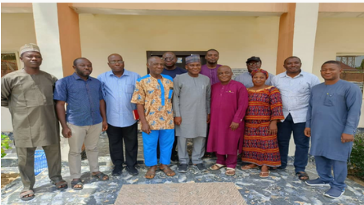
Group photograph of APHPN Taraba State Branch

APHPN Taraba State branch was formally inaugurated on the 26th of August 2023. We wish the state branch many notable achievements.