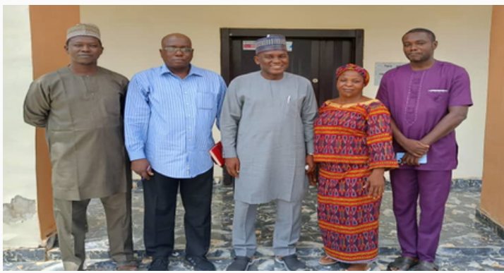
The Executive Committee of APHPN Taraba State Branch